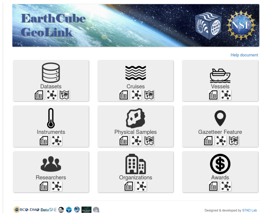
Fig. 1 The initial view of the GeoLink interface.

As a running example, we outline how the tabular view can assist users to get detail information about a researcher, how to relate this researcher to scientific cruises that he participated in, as well as the trajectories that scientific vessels took during these cruises. The initial view of the GeoLink interface is shown in figure 1.